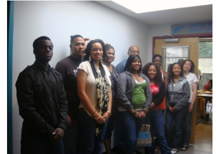
2009 Scholarship Recipients